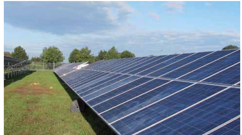
Krannich | Domsühl - Germany System: 1 MW | N-Rack System - Screw foundation