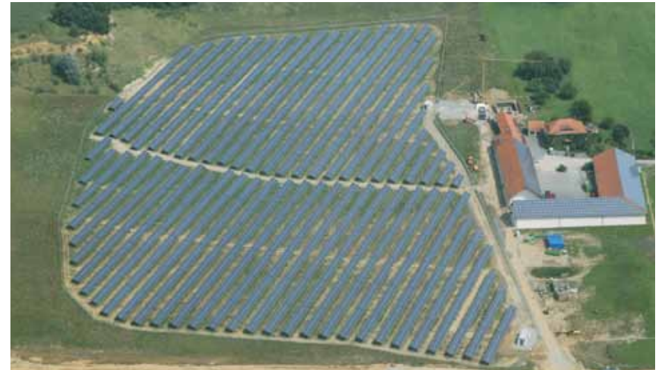
Novatech | Mallersdorf-Pfaffenberg - Germany System: 3,463 MW | N-Rack System - Screw foundation